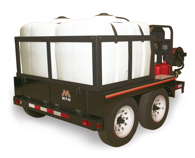
Storage area located under the water tanks